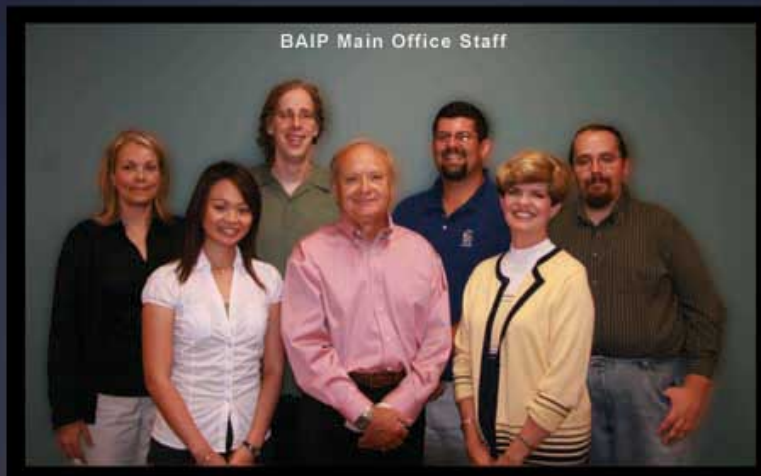
BAIP Main Office Staff